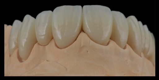
Figure 2: The two bridges on the model after ultra-micro layering with CERABIEN™ ZR FC Paste Stain (Kuraray Noritake Dental Inc.).