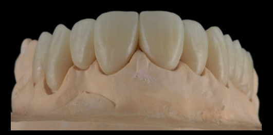
Figure 1: KATANA™ Zirconia YML 4-unit and 6-unit bridges after milling and sintering. A natural vestibular surface texture plays a decisive role in the creation of aesthetic monolithic restorations.

Usually, the aesthetic potential of a dental ceramic material – specifically its translucency – may be increased only at the expense of a decreased flexural strength. The new KATANA™ Zirconia YML from Kuraray Noritake Dental Inc. is different. With its high flexural strength of 1,100 MPa in the lower half of the blank and high translucency in the upper body and incisal areas, it has a high aesthetic potential and an unlimited indication range, as shown using the following case example.