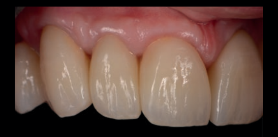
Figure 5: Buccal view of the 4-unit bridge cemented in the patient's mouth.

With this new type of multi-layered zirconia, it is possible to produce aesthetic monolithic restorations suitable even for use in the anterior area. A high design flexibility is offered despite strength gradation, and the high translucency in the incisal area is responsible for a natural look after sintering. Ultra-micro layering and glazing on the monolithic surface will be sufficient to produce outcomes to our patients' satisfaction.